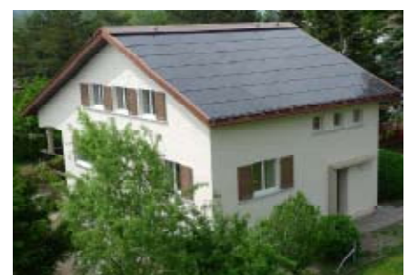
Fig. 7: With the PEB-refurbishment of Christoph Ospelt in Vaduz, the total energy consumption of 50,200 kWh/a was reduced to 7'000 kWh/a or by 86%. The PV-installation is producing 12,700 kWh/a, which leads to a solar energy excess of 5,700 kWh/a or 82% of the total energy need. Compared to the total need, the building has an energy self-supply of 182%: With the solar excess of 5,700 kWh/a between three and four solar-operated electric cars can drive 12,000 km annually.