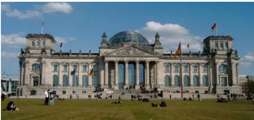
Fig. 6: In 1998, the world-renowned star architect Lord Norman Foster refurbished the historic Reichstag in Berlin dating from 1896. Thanks to an elegantly integrated 37.5 kW-PV-installation and a block heating station operated with organic rape of 2.35 MW, the Reichstag is today almost exclusively operated with renewable energies, and CO 2 emissions were reduced by 94%.