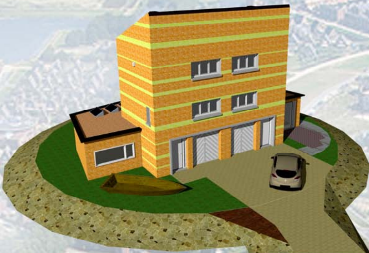
Google Sketchup rendering and accurate lighting.