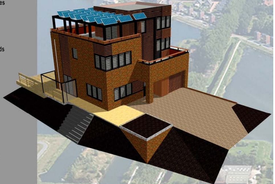
Building example from Project Stad Van De Zon, Heerhugowaard, Holland - Illustrative purposes only.

Or visit the website at www.bfc-solutions.co.uk