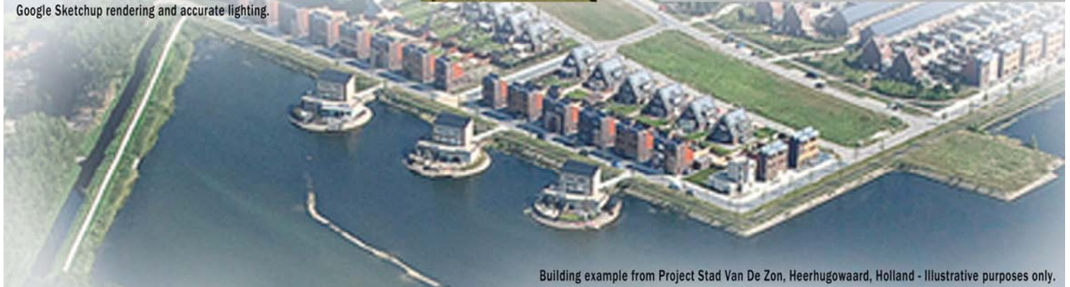
Building example from Project Stad Van De Zon, Heerhugowaard, Holland - Illustrative purposes only.