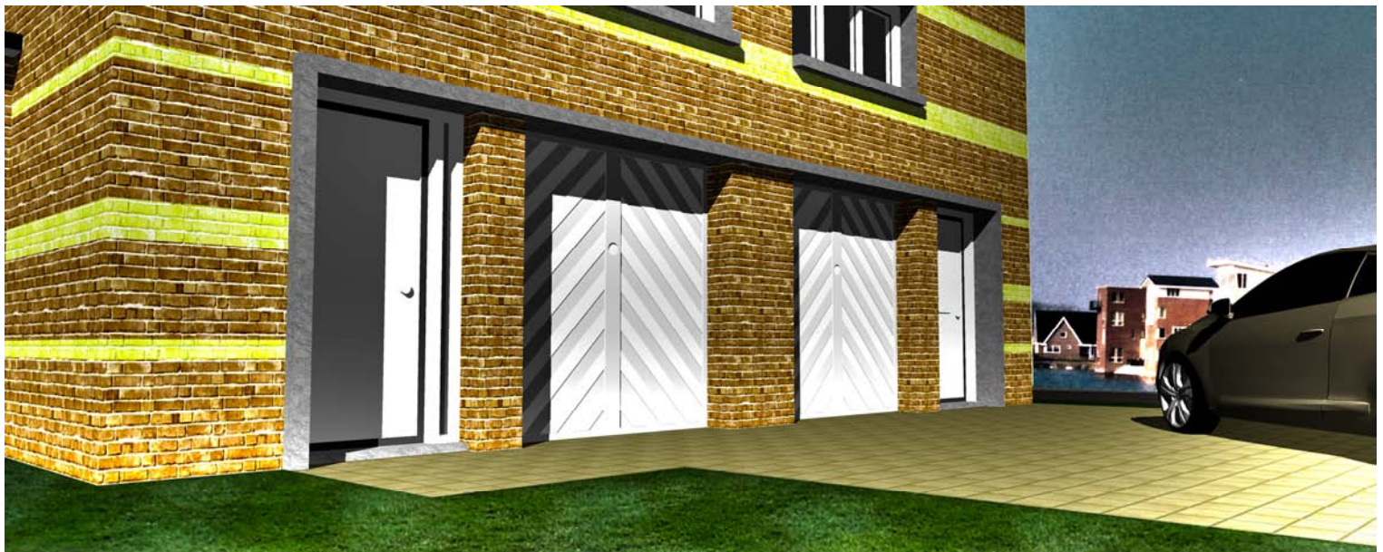
Final Adobe Photoshop render of Google Sketchup model.